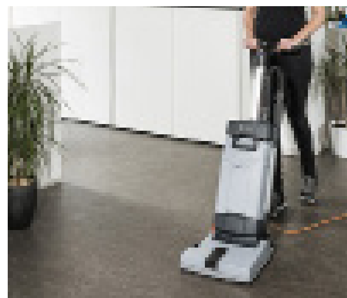
9. Move the machine with the handle and start cleaning the floor.