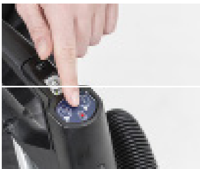
11. The red LED blinks when the machine is getting low on solution and fixed light when empty. Empty the recovery and refill the solution tank to continue working.