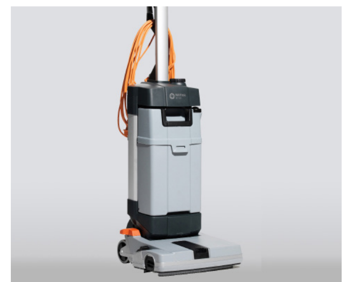
20. Clean the machine using a damp cloth and where needed use a neutral cleaning product. Then store the machine in a clean and dry place.

(*) ALWAYS FOLLOW THE DETERGENT DOSING RECOMMENDATION ON THE LABEL OF THE CHEMICAL PRODUCT USED.