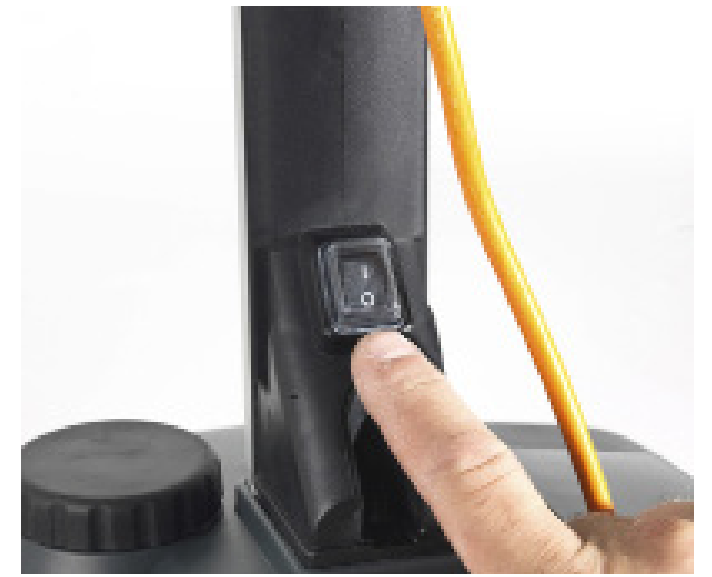
5. Turn on the machine with the main switch to "I".