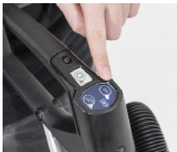
8. Press one of the solution buttons, according to the type of cleaning to be performed: 1 drop - normal cleaning 2 drop - heavy duty cleaning