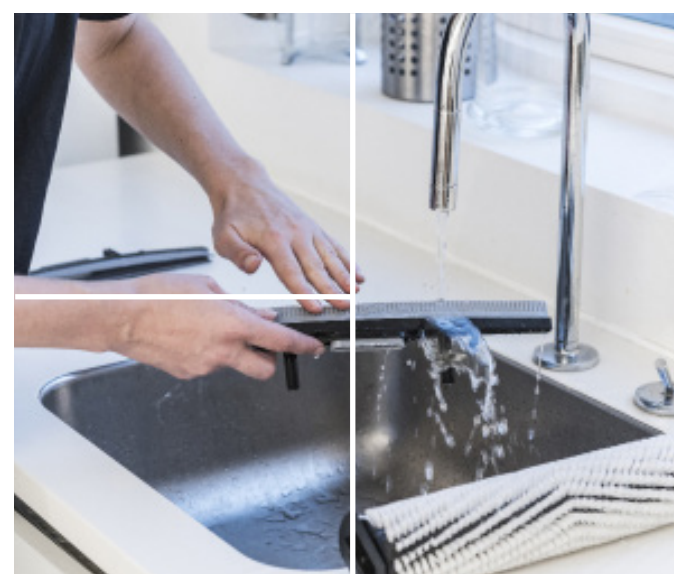
19. Clean the squeegee bars and the cylindrical brush with water.