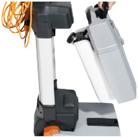
1. Release the handle to remove the tank assembly.

ATTENTION! Do not use the machine before you have read and understood the Instructions for use manual.