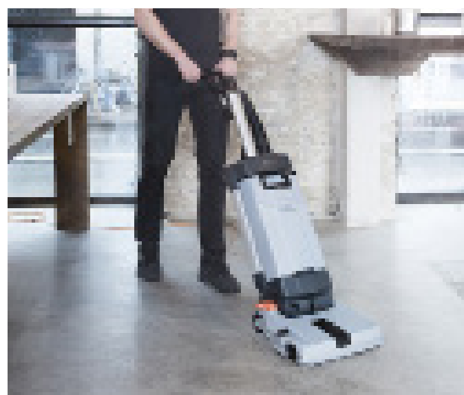
13. Park the machine in upright position. If needed turn off the machine by pressing the main button. Press the main switch to "0".