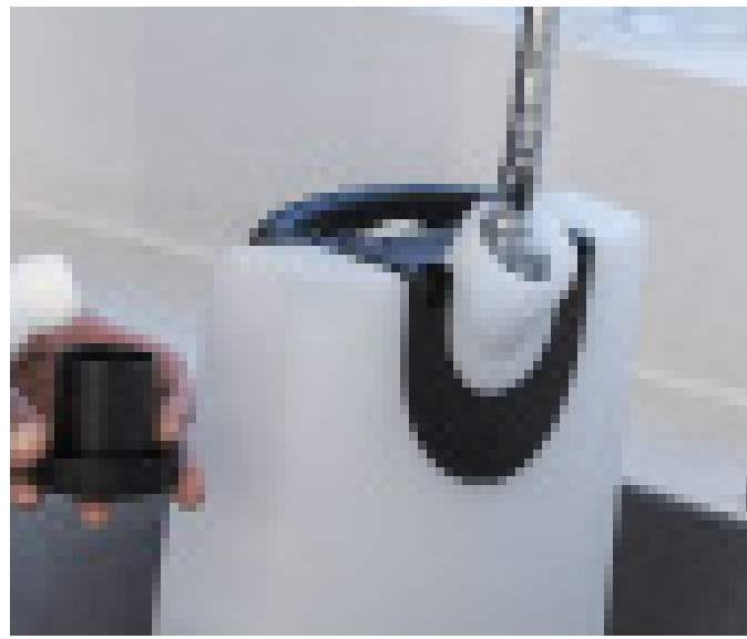
2. Fill the solution tank with a clean water. The clean water temperature must not exceed 40 °C.