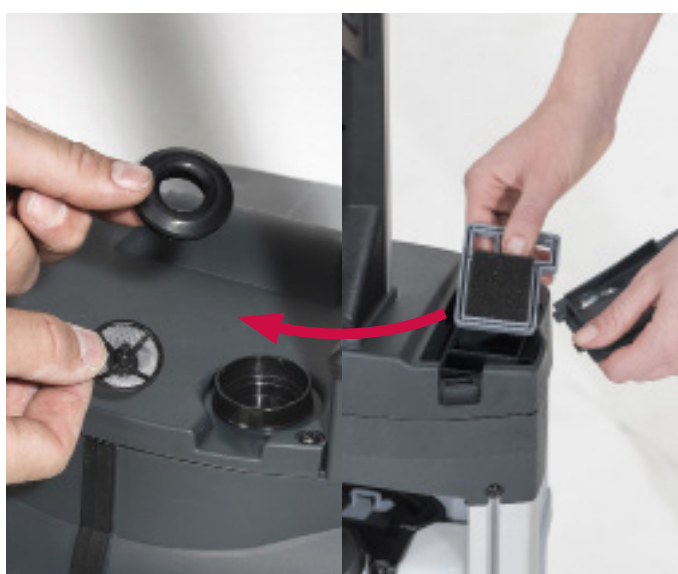
16. Check and clean the solution and vacuum filter regularly.