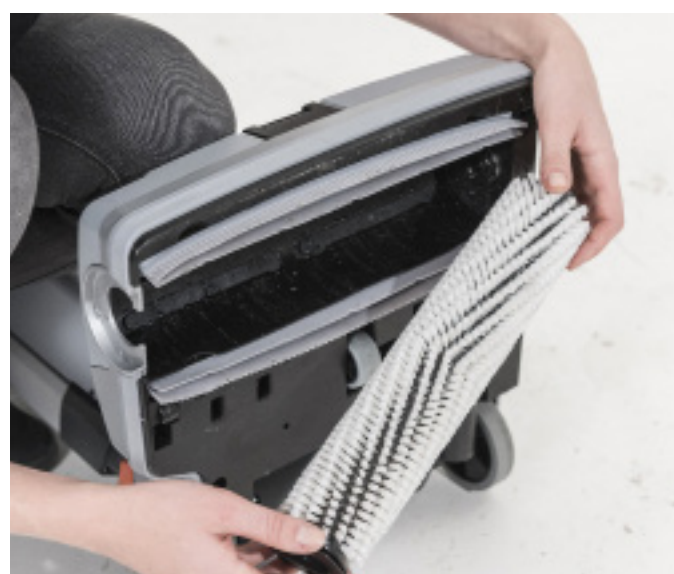
18. Unscrew by turning the knob clockwise to remove the cylindrical brush.