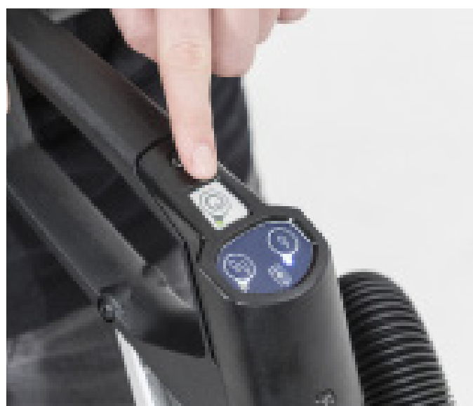
7. When machine is in working position press the main button and start cleaning. Machine will automatically stop when parked upright.