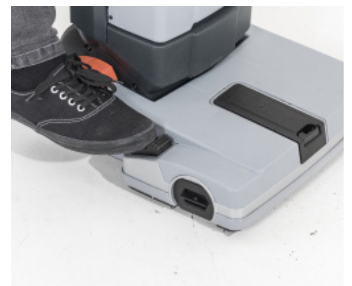
10. For double scrubbing, use the pedal to lift/lower squeegees.