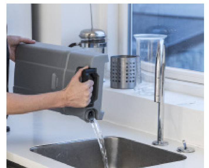
15. Empty the recovery and solution tank. Clean them with water.