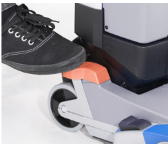
6. Use the orange pedal to put the machine in working position.