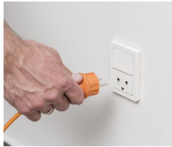
4. Connect the power plug to the electrical socket.