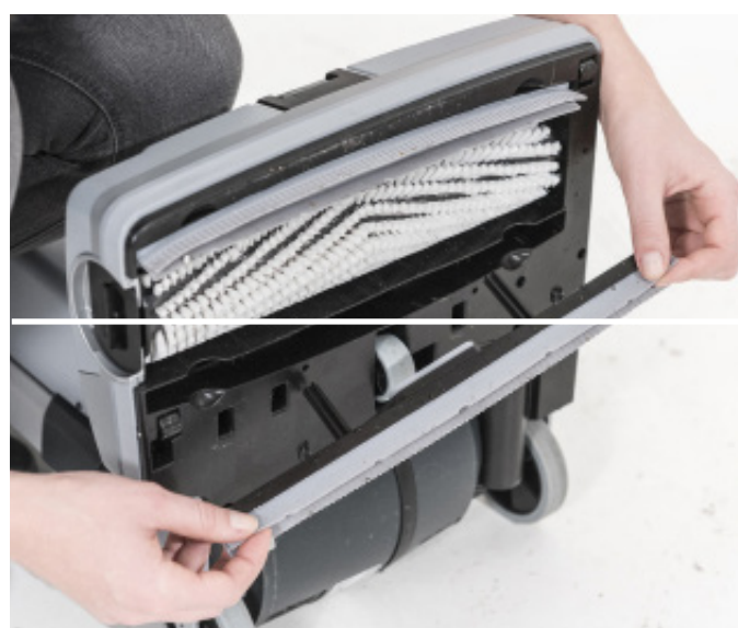
17. Remove the squeegee bars.