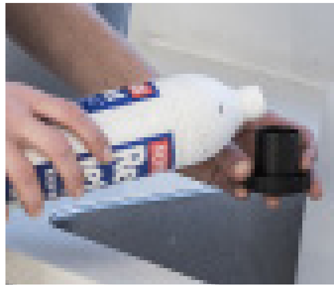
3. The tank cap can be used for dosing the detergent. One full cap is 30ml giving 1% detergent of the 3L tank capacity. (*)