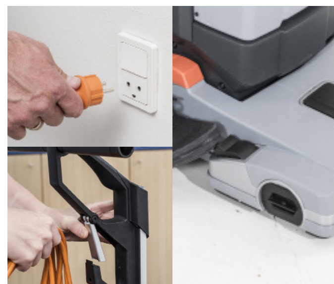
14. Disconnect the power plug from the electrical socket and rewind the cable from the machine and place it in the cable holder.