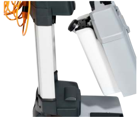
Each tank can be removed quickly and carried in one hand.