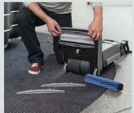
Apart from getting faster cleaning of hard floors, you will also be able to freshen up smaller carpets, including removal of spots, by adding an optional carpet kit. Brush and squeegees can be removed without any tool making daily maintenance operations easy and fast