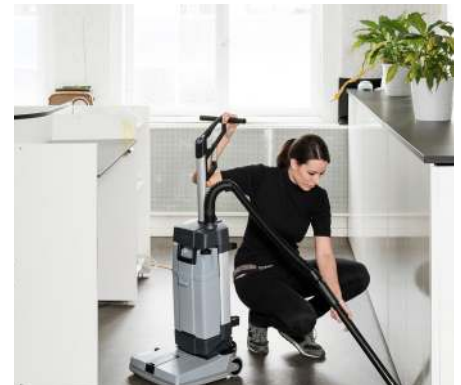
The optional manual suction hose is ideal for cleaning any unreachable area or spot cleaning.