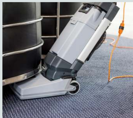
The SC100 clean in a position height of just 25 cm