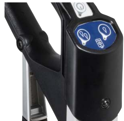
You will remain in full control of the scrubber dryer thanks to the intuitive touch display with two water settings and a solution indicator, alerting you if the tank is empty