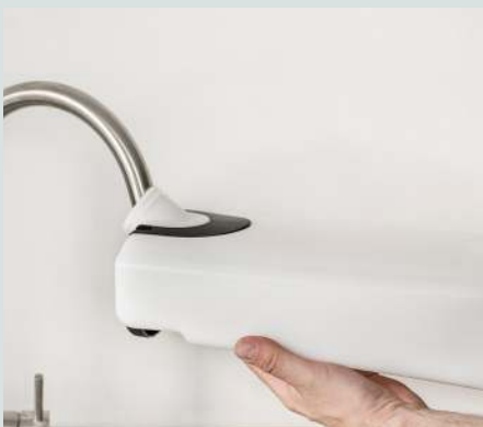
Easy to fill the solution tank with water in any low sink