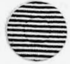
444830 Microfiber pad 17" - Ø 430 mm carpet cleaning - 5 pcs. CM43 F Orbital 109889 * CM43 F Orbital Spray 109890 *