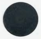
448203 Black abrasive disc 17" - Ø 430 mm, h 22 mm - heavy duty scrubbing of hard floors, pack of 6 pcs. CM43 F Orbital 109889 * CM43 F Orbital Spray 109890 *