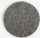
447000 Natural fibre polishing disc - 17" - Ø 430 mm (5 pz.) CM43 F Orbital 109889 * CM43 F Orbital Spray 109890 *