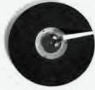
441613 Pad holder for sandpaper - 17" - Ø 430 mm CM43 F Orbital 109889 * CM43 F Orbital Spray 109890 *