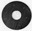
445005 Cushioned pad holder with full velcro on the entire surface, with 6 mm foam - 17" - Ø 430 mm CM43 F Orbital 109889 * CM43 F Orbital Spray 109890 *