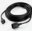
441250 Extension cord with EU plug CM43 F Orbital 109889 * CM43 F Orbital Spray 109890 *