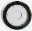
445414 Nylon brush 0.50 mm for washing - 17" - Ø 430 mm CM43 F Orbital 109889 * CM43 F Orbital Spray 109890 *