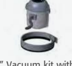
225411 17" Vacuum kit with add. nylon pre-filter, supp. bracket, dust guard, connection hose Ø 32mmØ, 40mm fitting* CM43 F Orbital 109889 *