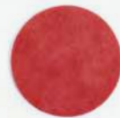
448207 Red abrasive disc 17" - Ø 430 mm, h 22 mm - spray cleaning maintenance on protected floors - 6 pcs. CM43 F Orbital 109889 * CM43 F Orbital Spray 109890 *