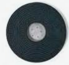
442237 Pad holder for steel wool - With textured rubber surface - 17" - Ø 430 mm CM43 F Orbital 109889 * CM43 F Orbital Spray 109890 *