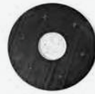
442911 Standard pad holder with full velcro on the entire surface, without foam - 17" - Ø 430 mm CM43 F Orbital 109889 * CM43 F Orbital Spray 109890 *